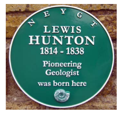
Plaque: Hunton's House, Hummersea