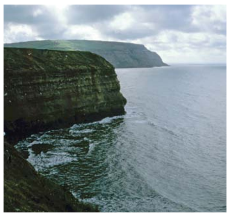
Towards Boulby Cliffs from Cow Bar, Staithes